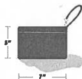
SMALL CLUTCH PURSE NO LARGER THAN 5" X 7"