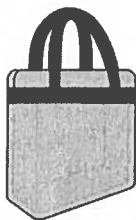
CLEAR TOTE PLASTIC, VINYL, OR PVC AND NO LARGER THAN 12" X 6" X 12"