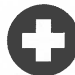
MEDICAL ITEMS ITEMS RELATED TO A MEDICAL CONDITION

The Clear Bag Policy strictly limits the size and types of bags that are permitted.